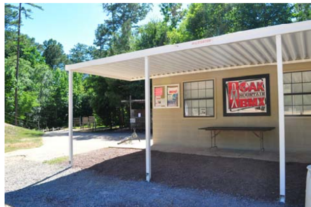
The sign after installation at the Oak Mountain facility.