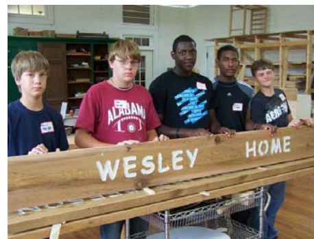
Looks like another job well done!