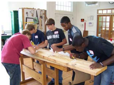
Young men from the Ranch try their hand at painting their signs